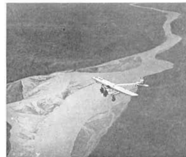
The Colorado River forms the California-Arizona Boundary line

Considerably over 100 miles per hour, the Air Liner speeds on, and soon the narrow ribbon of the Colorado River, winding its muddy course towards the Gulf of California, comes into view. The Plane is now entering the Palo Verde Valley, and the passengers can see the town of Blythe, on the West bank of the Colorado River.