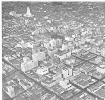
The business district of Los Angeles

LEAVING LOS ANGELES at 8:00 o'clock, A. M., Pacific Standard Time, we fly East, passing directly over the Industrial Section of Metropolitan Los Angeles. On the left you will observe, in the center of the height limit buildings of the downtown business section, the new City Hall, its twenty-eight stories of white marble glistening in the sunshine, and looking beyond, you see the beautiful Hollywood Hills, with Mulholland Drive at the "skyline."