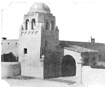
"Club Social" at Agua Prieta

The Plane soars over the Coronado National Forest, and we are now in New Mexico. Hachita,