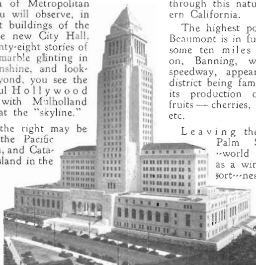
The new Los Angeles City Hall

On the right may be seen the Pacific Ocean, and Catalina Island in the