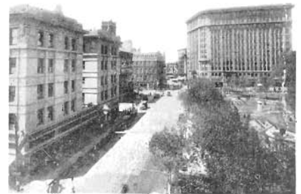
Street scene, El Paso, Texas

Tucson, from accredited records, is one of the oldest cities in the United States, having been chartered by the King of Spain in 1540. Rich as an agricultural and cattle raising district, it is particularly interesting.