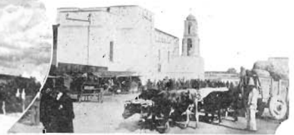
Street Scene, Juarez

In a few moments the Plane passes over Casa Grande National Monument, and the City of Casa Grande can be seen, located on the railway to the right, as the Air Liner speeds on towards Picacho, where the course of the STANDARD AIRLINER practically parallels the Railway, passing between two mountain ranges. The Santa Cruz Valley lies below, most of which is irrigated by wells.