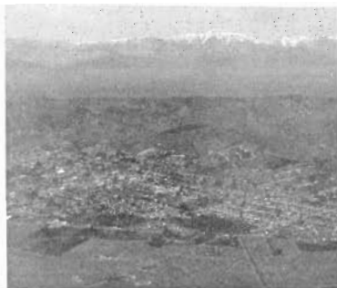
Whittier and its orange groves

At an altitude of approximately three thousand feet, we fly smoothly onward, passing wonderful oil fields, with Signal Hill and Santa Fe Springs in full view. Again, on the left, can be seen Pasadena, Altadena, Sierra Madre and the historical San Gabriel Mission, which was founded by Father Junipero Serra in 1771; Mount Lowe, with its white domed observatory, a mile above sea level; Mount Wilson, 6100 feet high and San Gabriel Peak amid the Angelus National Forest; San Gabriel and Pomona Valleys now come into view, with Old Baldy (Mount San Antonio), towering in the distance; El Monte, Bassett, Puente, Walnut, Spadra, Whittier and Pomona, with Fullerton, Anaheim and Santa Ana, also Corona with its circle drive, providing the passenger on the "STANDARD AIRLINES" a wonderful vista of orange groves, vineyards, fertile fields and cities.