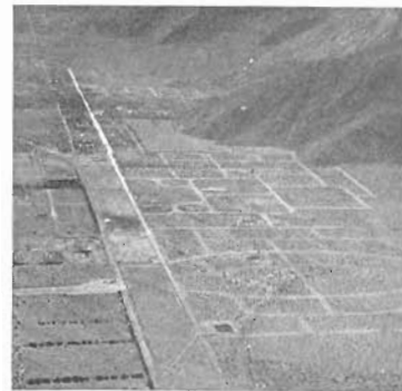
Palm Springs, famous winter resort

Leaving the Pass, Palm Springs — world famous as a winter resort — nestles at