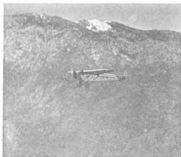
Mt. San Jacinto

On the left, the City of Riverside, with its beautiful buildings comes into view. Mount Rubidoux, renowned for its impressive Easter Services, and the Mission Inn, depicting the early history of California, and visited by thousands of tourists annually, are points of interest.