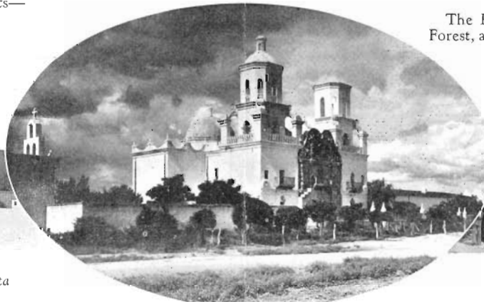
Mission of "San Xavier del Boc"